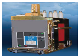
EATON AM-13.8-VR-1000 VACIO