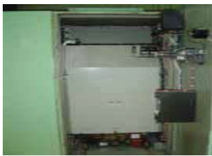
IEM / WESTINGHOUSE 50 DHP 250 AIRE