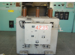
GENERAL ELECTRIC AM 13.8-100-4H AIRE