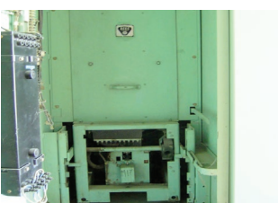
ACEC CHARLEROY AM DMA 3 AIRE