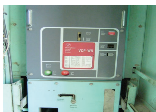
EATON 50 VCP WR 250 VACIO