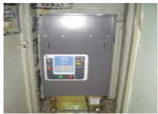
EATON 50 DHP-VR 250 VACIO